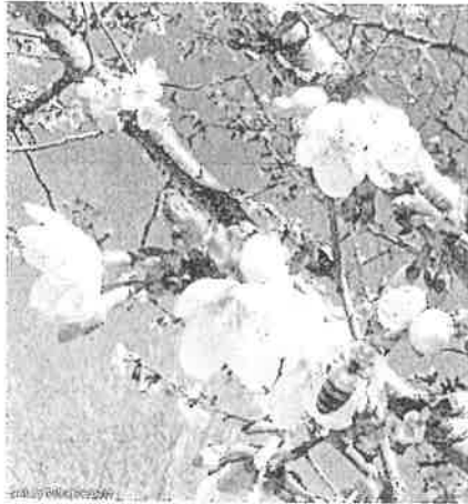
"I went outside this morning to check on spring flowers, and heard a buzzing noise," Montague Center reader Sally Pick reports. "I looked up at the cherry tree, and it was loaded with honeybees from local hives!"