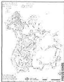
Corridors and stepping stones, illustrated in Montague's pollinator action plan.

"Bumblebees live in colonies, they can fly up to a mile, and they're large, so they do a lot of pollinating of our crops — but there are seven families of native bees, five major ones... 90% of the bees are solitary, and of those, 70% nest in the ground. It's like they're invisible to us."